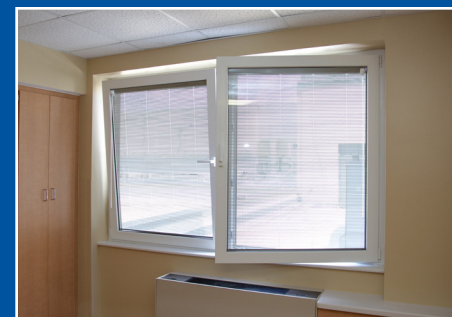
Euroview windows provide superior energy efficiency, sound control and low maintenance. They tilt in for ventilation, swing in for ease of cleaning or emergency egress. Interior is white vinyl with color matched hardware and bronze exterior laminate.