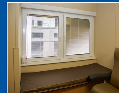
These particular window units are furnished with glass package and between the glass venetian blinds