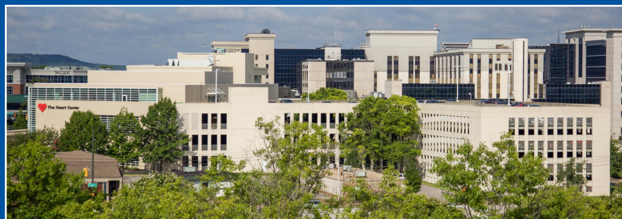
VEKA's Euroview window and door systems are the smart choice, classic design and an economical solution.