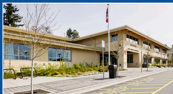
Contemporary aluminum look painted PVC frame and sash provides significantly improved thermal performance.