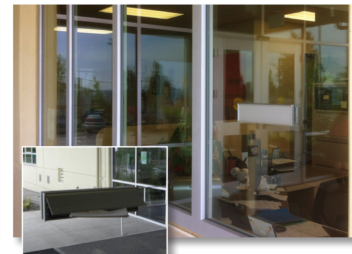
Cut in mail slot to center of sealed unit in office area solved problem as no other convenient space to install mail slot.