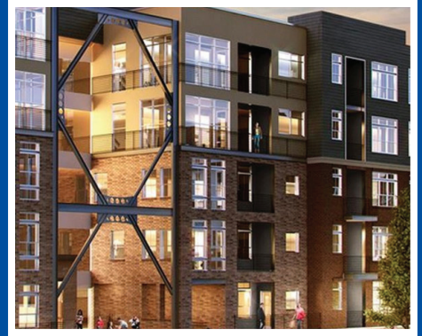
Outdoor courtyards on two levels with plantings inspired by the landscape of the nearby Rocky Mountain foothills give residents easy access to nature in the city. A lounge with tech bar, billiards room, bark park, fitness room, and pool are just a few of the amenities available.