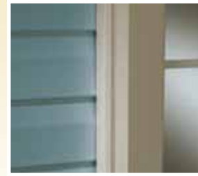
PVC brick mold