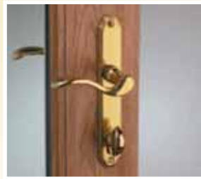
Optional brass hardware