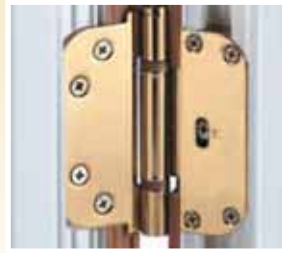
3-way adjustable hinge