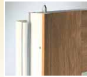
True french center shoot bolt