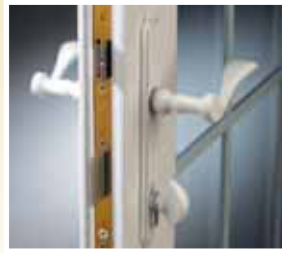
Key operated lock with deadbolt