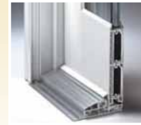
Vinyl sill with aluminum threshold