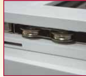
Plated steel adjustable tandem rollers