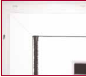
All welded frame and sash