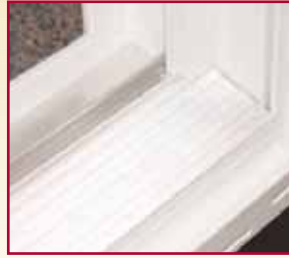
Vinyl threshold cover