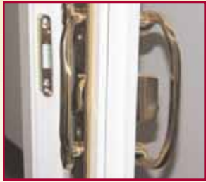
Optional brass hardware